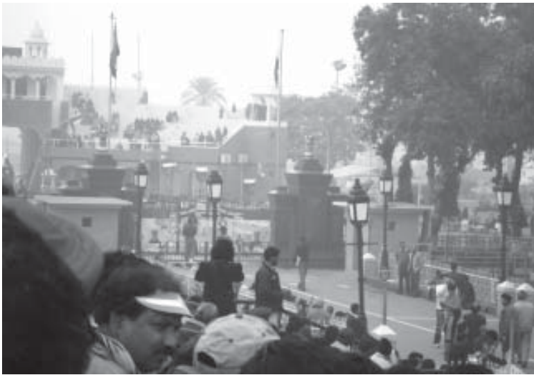
Fig. 10.1 Wagah Border is not only a tourist place but also used for trade between India and Pakistan

goods. At this stage, enterprises owned by government (known as State Owned Enterprises—SOEs), which we, in India, call public sector enterprises, were made to face competition. The reform process also involved dual pricing. This means fixing the prices in two ways; farmers and industrial units were required to buy and sell fixed quantities of inputs and outputs on the basis of prices fixed by the government and the rest were purchased and sold at market prices. Over the years, as production increased, the proportion of goods or inputs transacted in the market also increased. In order to attract foreign investors, special economic zones were set up.