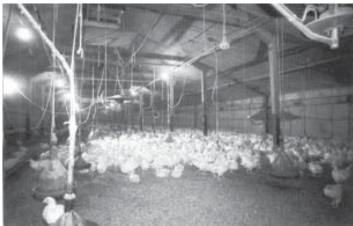
Fig. 6.4 Poultry has the largest share of total livestock in India

However problems related to over-fishing and