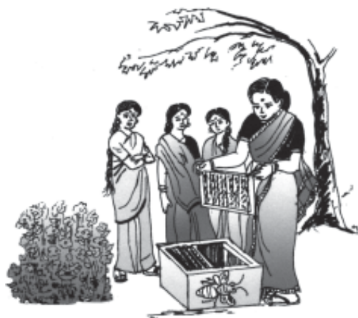
Fig. 6.5 Women in rural households take up bee-keeping as an entrepreneurial activity

Horticulture: Blessed with a varying climate and soil conditions, India has adopted growing of diverse horticultural crops such as fruits, vegetables, tuber crops, flowers, medicinal and aromatic plants, spices and plantation crops. These crops play a vital role in providing food and nutrition, besides addressing employment concerns. The period between 1991-2003 is also called an effort to heralding a 'Golden Revolution' because during this period, the planned investment in horticulture became highly productive and the sector emerged as a sustainable livelihood option. India has emerged as a world leader in producing a variety of fruits like mangoes, bananas, coconuts, cashew nuts and a number of spices and is the second largest producer of fruits and vegetables. Economic condition of many farmers engaged in horticulture has improved and it has become a means of improving livelihood for many unprivileged