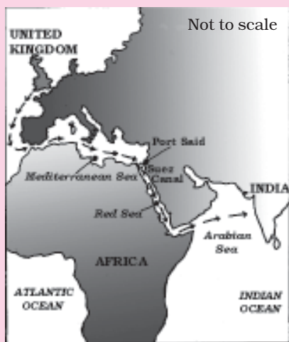
Fig.1.2 Suez Canal: Used as highway between India and Britain

Various details about the population of British India were first collected through a census in 1881. Though suffering from certain limitations, it revealed the unevenness in India's population growth. Subsequently,