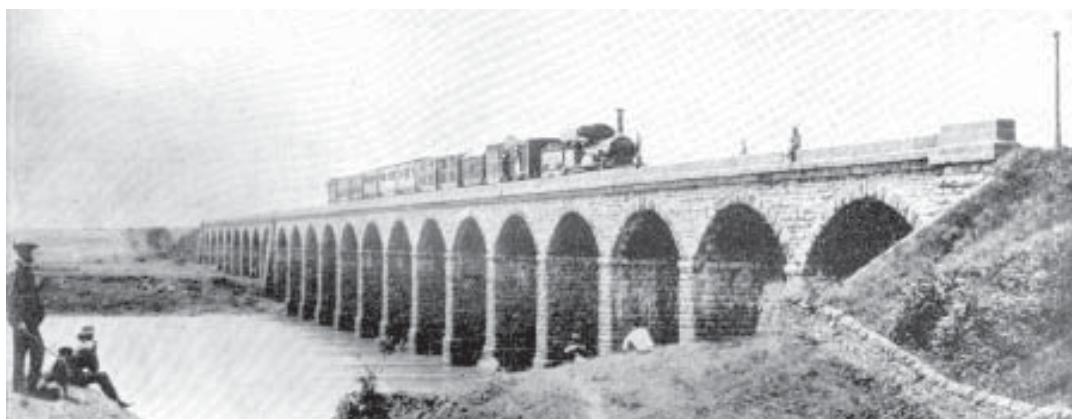
Fig. 1.4 First Railway Bridge linking Bombay with Thane, 1854

Indian people gained owing to the introduction of the railways, were thus outweighed by the country's huge economic loss.