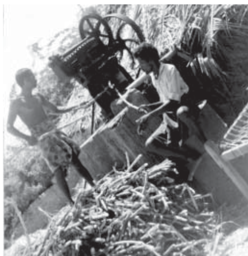
Fig. 6.2 Jaggery making is an allied activity of the farming sector

As agriculture is already overcrowded, a major proportion of the increasing labour force needs to find alternate employment opportunities in other non-farm sectors. Non-farm economy has several segments in it;