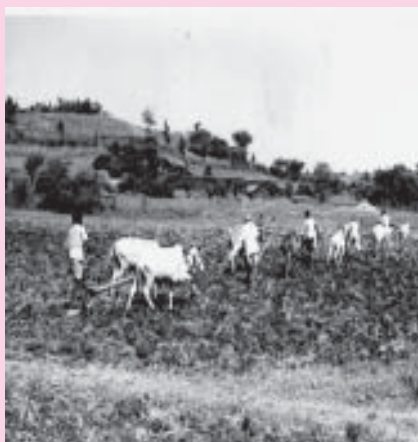
Fig. 1.1 India's agricultural stagnation under the British colonial rule

The French traveller, Bernier, described seventeenth century Bengal in the following way: "The knowledge I have acquired of Bengal in two visits inclines me to believe that it is richer than Egypt. It exports, in abundance, cottons and silks, rice, sugar and butter. It produces amply — for its own consumption — wheat, vegetables, grains, fowls, ducks and geese. It has immense herds of pigs and flocks of sheep and goats. Fish of every kind it has in profusion. From rajmahal to the sea is an endless number of canals, cut in bygone ages from the Ganges by immense labour for navigation and irrigation."