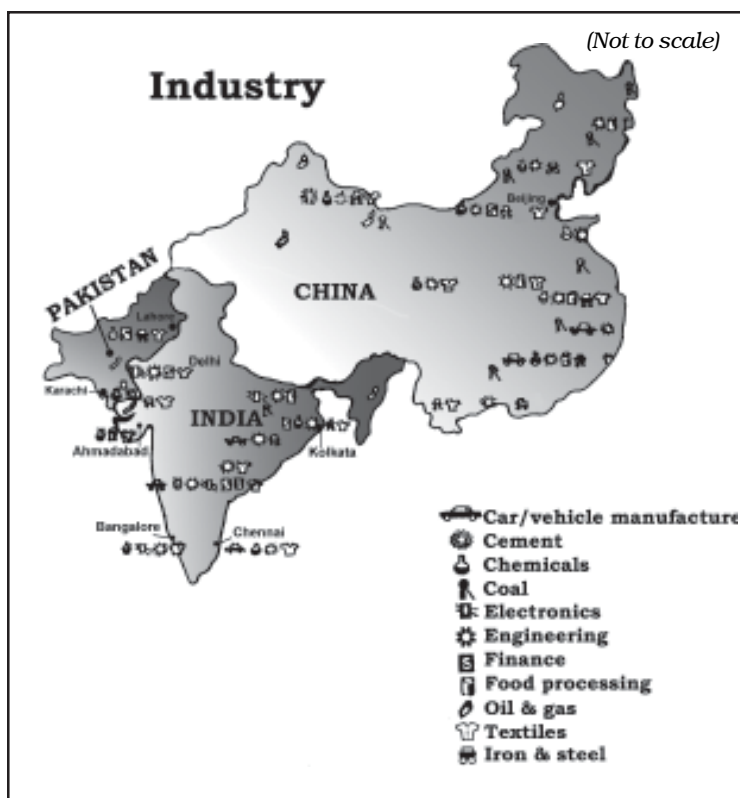
Fig. 10.3 Industry in India, China and Pakistan.

China's growth rates whereas Pakistan met with drastic decline at 4.7 per cent. Some scholars hold the reform processes introduced in 1988 in Pakistan and political instability as reasons behind this trend. We will study in a later section which sector contributed to this trend in these countries.