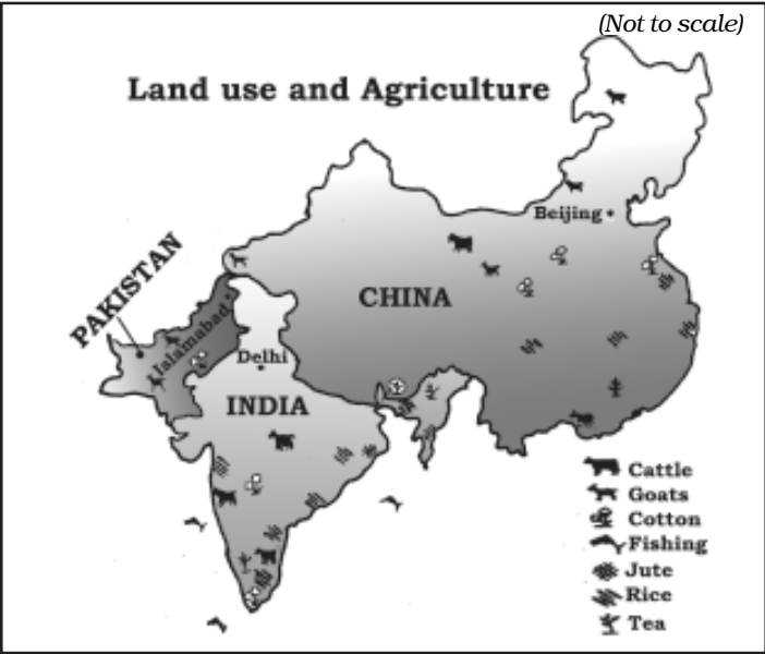
Fig. 10.2 Land use and agriculture in India, China and Pakistan

When many developed countries were finding it difficult to maintain a growth rate of even 5 per cent, China was able to maintain near double-digit growth for more than two decades as can be seen from Table 10.2. Also notice that in the 1980s Pakistan was ahead of India; China was having double-digit growth and India was at the bottom. In 2000-10, there is a marginal decline in India and