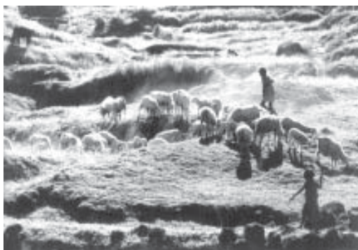
Fig. 6.3 Sheep rearing — an important income augmenting activity in rural areas

followed by others. Other animals which include camels, asses, horses, ponies and mules are in the lowest rung. India had about 304 million cattle, including 105 million buffaloes, in 2007. Performance of the Indian dairy sector over the last three decades has been quite impressive. Milk production in the country has increased by more than five times between 1960-2009. This can be attributed mainly to the successful implementation of 'Operation Flood'. It is a system whereby all the farmers can pool their milk produced according to different grading (based on quality) and the same is processed and marketed to urban centres through cooperatives. In this system the farmers are assured of a fair price and income from the supply of milk to urban markets. As pointed out earlier Gujarat state is held as a success story in the efficient implementation of milk cooperatives which has been emulated by many states. Meat, eggs, wool and other by-products are also emerging as