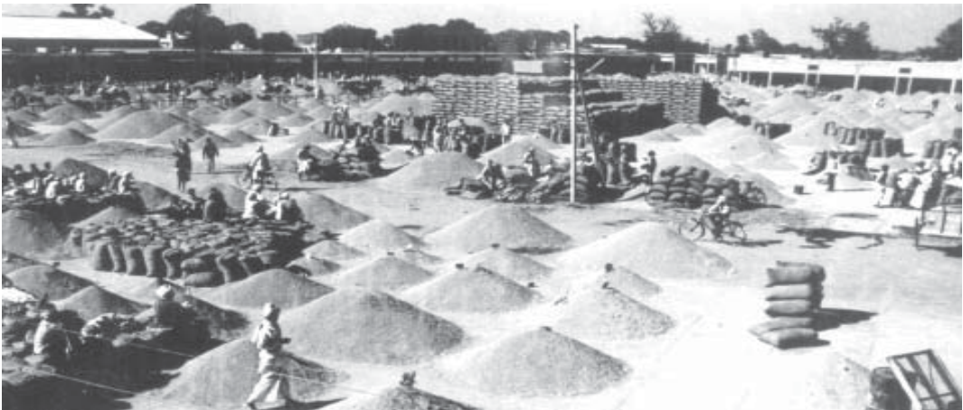
Fig. 6.1 Regulated market yards benefit farmers as well as consumers

Let us discuss four such measures that were initiated to improve the marketing aspect. The first step was regulation of markets to create orderly and transparent marketing conditions. By and large, this policy benefited farmers as well as consumers. However, there is still a need to develop about 27,000 rural periodic markets as regulated market places to realise the full potential of rural markets. Second component is provision of physical infrastructure facilities like roads, railways, warehouses, godowns, cold storages and processing units. The current infrastructure facilities are quite inadequate to meet the growing demand and need to be improved. Cooperative marketing, in realising fair prices for farmers' products, is the third aspect of government initiative. The success of milk cooperatives in transforming the