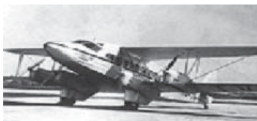
Fig.1.5 Tata Airlines, a division of Tata and Sons, was established in 1932 inaugurating the aviation sector in India

cost to the government exchequer, yet, it failed to compete with the railways, which soon traversed the region running parallel to the canal, and had to be ultimately abandoned. The introduction of the expensive system of electric telegraph in India, similarly, served the purpose of maintaining law and order. The postal services, on the other hand, despite serving a useful public purpose, remained all through