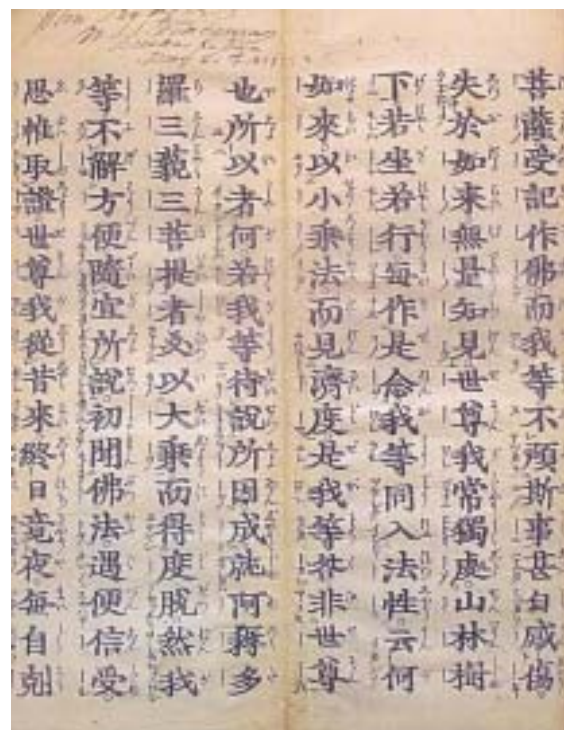
Fig. 2 – A page from the Diamond Sutra.

Calligraphy – The art of beautiful and stylised writing