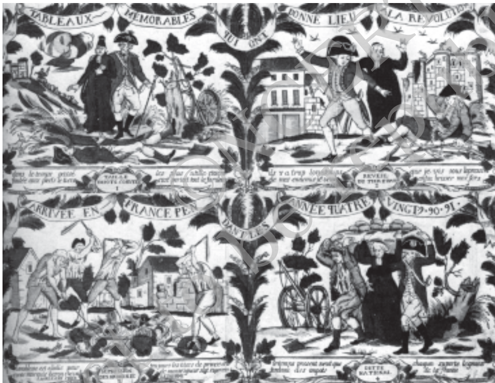
Fig. 11 – The nobility and the common people before the French Revolution, a cartoon of the late eighteenth century.

Imagine that you are a cartoonist in France before the revolution. Design a cartoon as it would have appeared in a pamphlet.