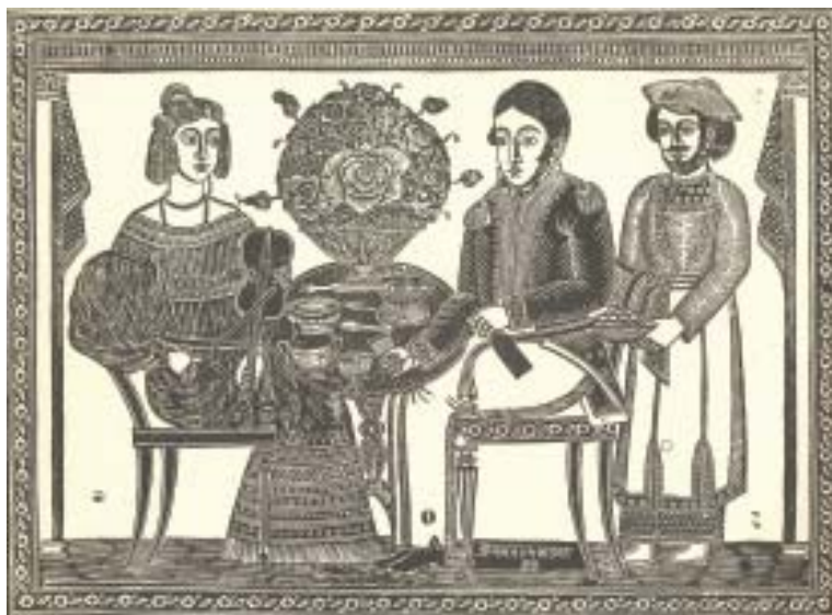
Fig. 21 – A European couple sitting on chairs, nineteenth-century woodcut.

The picture suggests traditional family roles. The Sahib holds a liquor bottle in his hand while the Memsahib plays the violin.