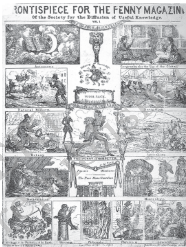
Fig. 12 – Frontispiece of Penny Magazine. Penny Magazine was published between 1832 and 1835 in England by the Society for the Diffusion of Useful Knowledge. It was aimed primarily at the working class.

Lending libraries had been in existence from the seventeenth century onwards. In the nineteenth century, lending libraries in England became instruments for educating white-collar workers, artisans and lower-middle-class people. Sometimes, self-educated working class people wrote for themselves. After the working day was gradually shortened from the mid-nineteenth century, workers had some time for self-improvement and self-expression. They wrote political tracts and autobiographies in large numbers.