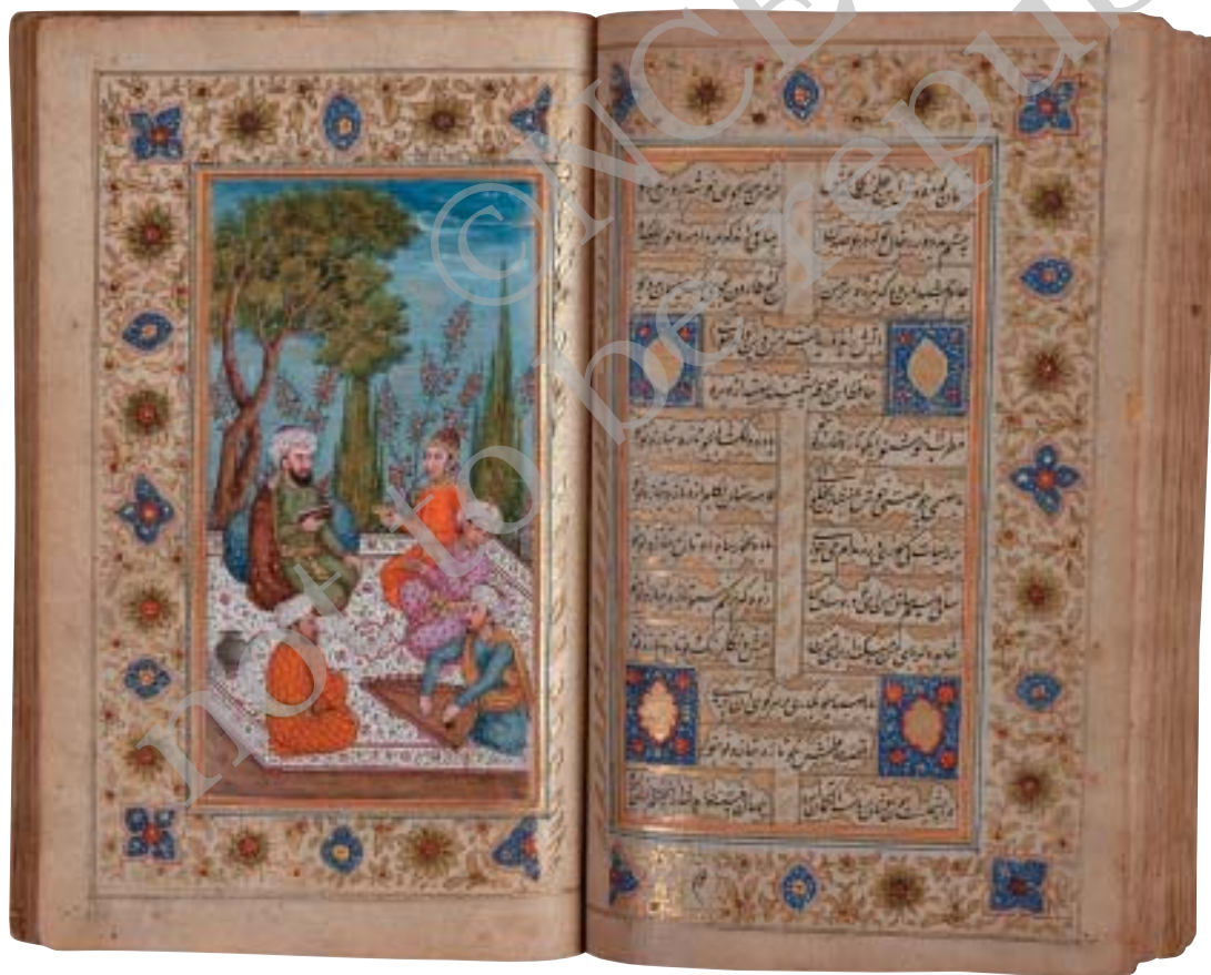
Fig. 15 – Pages from the Diwan of Hafiz, 1824.

Hafiz was a fourteenth-century poet whose collected works are known as Diwan. Notice the beautiful calligraphy and the elaborate illustration and design. Manuscripts like this continued to be produced for the rich even after the coming of the letterpress.