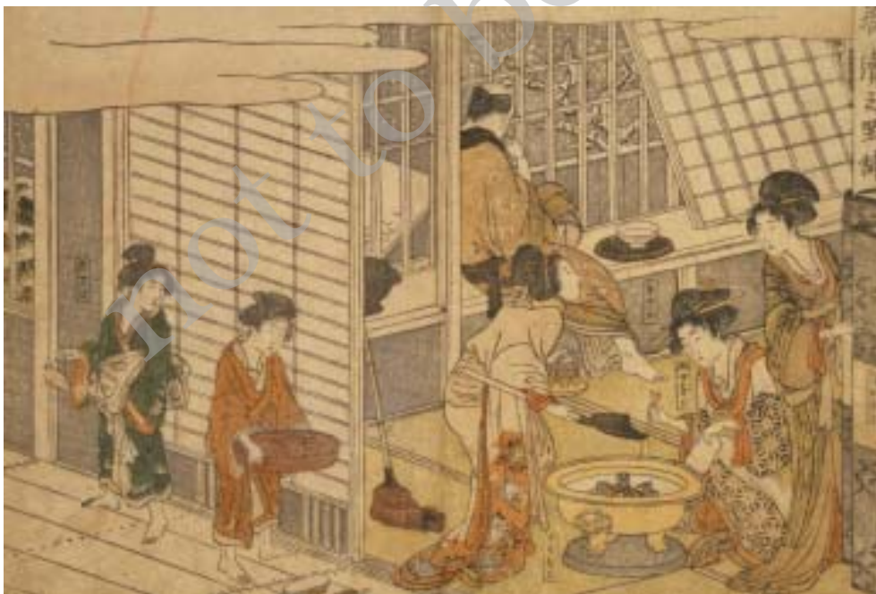
Fig. 4 – A morning scene, ukiyo print by Shunman Kubo, late eighteenth century. A man looks out of the window at the snowfall while women prepare tea and perform other domestic duties.