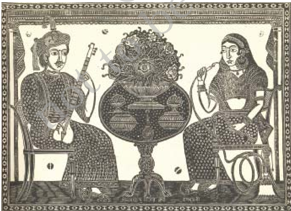
Fig. 20 – An Indian couple, black and white woodcut.

The artist's vision of the destruction of proper family relations. Here the husband is totally dominated by his wife who is perched on his shoulder. He is cruel towards his mother, dragging her like an animal, by the noose.