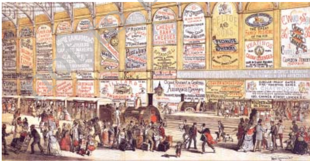
Fig. 13 – Advertisements at a railway station in England, a lithograph by Alfred Concanen, 1874. Printed advertisements and notices were plastered on street walls, railway platforms and public buildings.

Look at Fig. 13. What impact do such advertisements have on the public mind? Do you think everyone reacts to printed material in the same way?