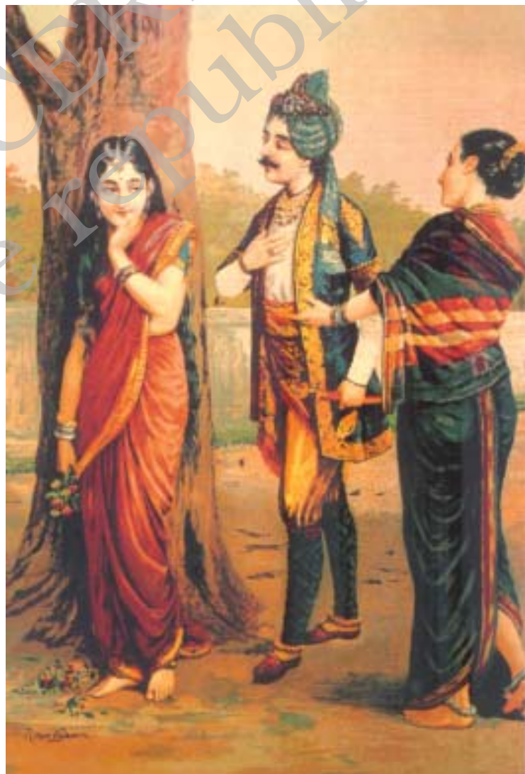
Fig. 17 – Raja Ritudhwaj rescuing Princess Madalsa from the captivity of demons, print by Ravi Varma. Raja Ravi Varma produced innumerable mythological paintings that were printed at the Ravi Varma Press.

By the 1870s, caricatures and cartoons were being published in journals and newspapers, commenting on social and political issues. Some caricatures ridiculed the educated Indians' fascination with Western tastes and clothes, while others expressed the fear of social change. There were imperial caricatures lampooning nationalists, as well as nationalist cartoons criticising imperial rule.