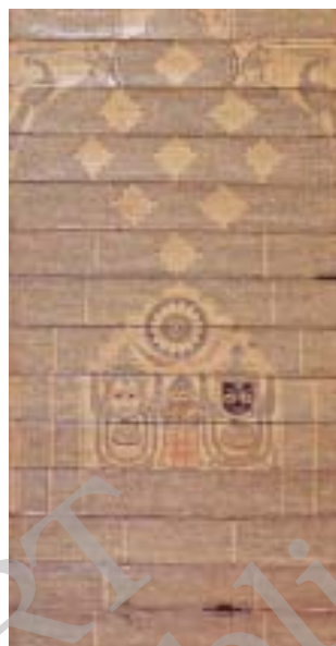
Fig. 14 – Pages from the Gita Govinda of Jayadeva, eighteenth century. This is a palm-leaf handwritten manuscript in accordion format.

Manuscripts, however, were highly expensive and fragile. They had to be handled carefully, and they could not be read easily as the