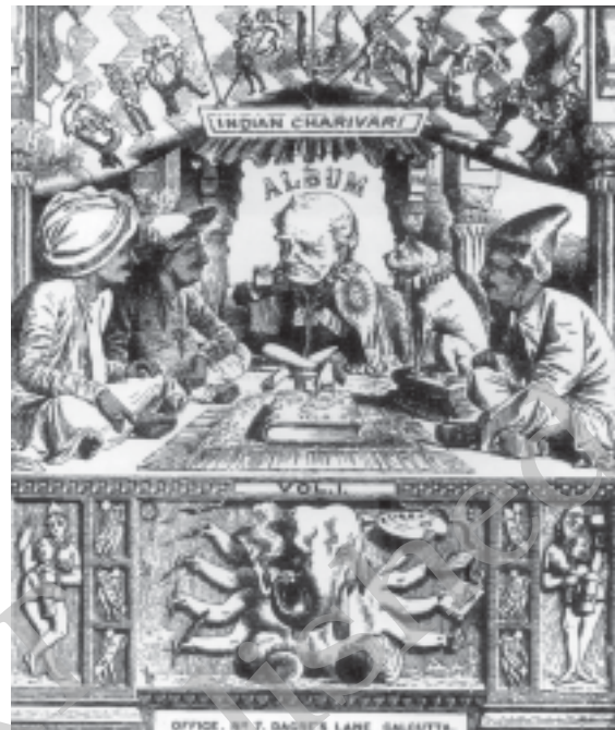
Fig. 18 – The cover page of Indian Charivari. The Indian Charivari was one of the many journals of caricature and satire published in the late nineteenth century. Notice that the imperial British figure is positioned right at the centre. He is authoritative and imperial; telling the natives what is to be done. The natives sit on either side of him, servile and submissive. The Indians are being shown a copy of Punch, the British journal of cartoons and satire. You can almost hear the British master say – 'This is the model, produce Indian versions of it.'

While Urdu, Tamil, Bengali and Marathi print culture had developed early, Hindi printing began seriously only from the 1870s. Soon, a large segment of it was devoted to the education of women. In