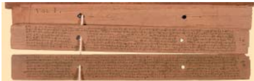
Fig. 16 – Pages from the Rigveda.

script was written in different styles. So manuscripts were not widely used in everyday life. Even though pre-colonial Bengal had developed an extensive network of village primary schools, students very often did not read texts. They only learnt to write. Teachers dictated portions of texts from memory and students wrote them down. Many thus became literate without ever actually reading any kinds of texts.