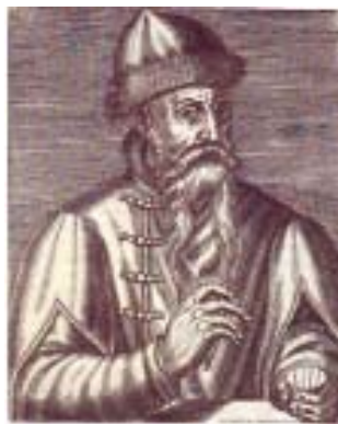
Fig. 5 – A Portrait of Johann Gutenberg, 1584.

This shift from hand printing to mechanical printing led to the print revolution.