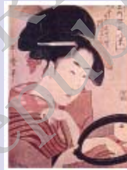
Fig. 3 – An ukiyo print by Kitagawa Utamaro.

Kitagawa Utamaro , born in Edo in 1753, was widely known for his contributions to an art form called ukiyo ('pictures of the floating world') or depiction of ordinary human experiences, especially urban ones. These prints travelled to contemporary US and Europe and influenced artists like Manet, Monet and Van Gogh. Publishers like Tsutaya Juzaburo identified subjects and commissioned artists who drew the theme in outline. Then a skilled woodblock carver pasted the drawing on a woodblock and carved a printing block to reproduce the painter's lines. In the process, the original drawing would be destroyed and only prints would survive.