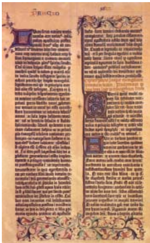
Fig. 7 – Pages of Gutenberg's Bible, the first printed book in Europe.

Gutenberg printed about 180 copies, of which no more than 50 have survived.