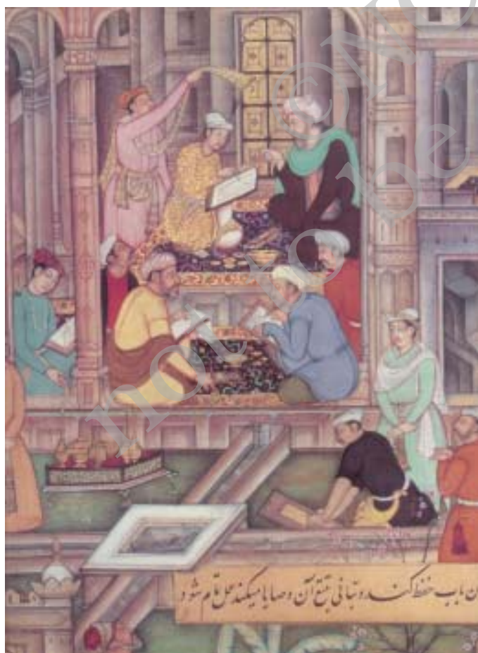
Fig. 1 – Book making before the age of print, from Akhlaq-i-Nasiri, 1595.

In this chapter we will look at the development of print, from its beginnings in East Asia to its expansion in Europe and in India. We will understand the impact of the spread of technology and consider how social lives and cultures changed with the coming of print.