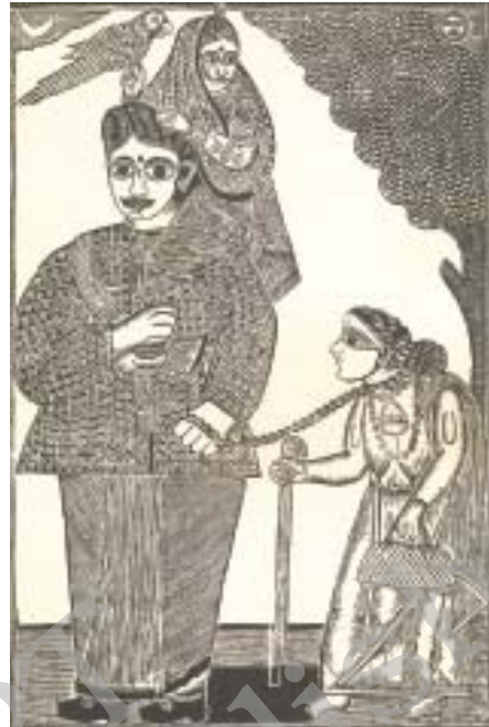
Fig. 19 – Ghor Kali (The End of the World), coloured woodcut, late nineteenth century.

In Bengal, an entire area in central Calcutta – the Battala – was devoted to the printing of popular books. Here you could buy cheap editions of religious tracts and scriptures, as well as literature that was considered obscene and scandalous. By the late nineteenth century, a lot of these books were being profusely illustrated with woodcuts and coloured lithographs. Pedlars took the Battala publications to homes, enabling women to read them in their leisure time.