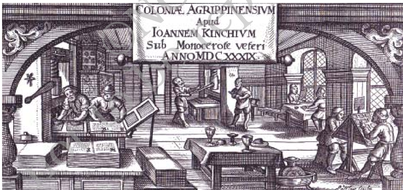
Fig. 8 – A printer's workshop, sixteenth century.

In the text you will notice the use of colour within the letters in various places. This had two functions: it added colour to the page, and highlighted all the holy words to emphasise their significance. But the colour on every page of the text was added by hand. Gutenberg printed the text in black, leaving spaces where the colour could be filled in later.