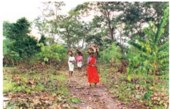
Fig.6 - Women returning home after collecting fuelwood.