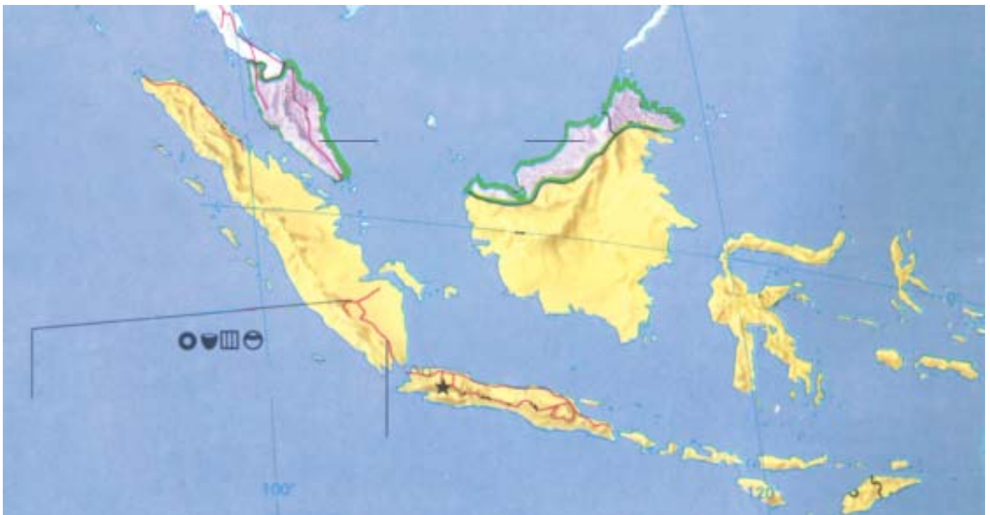
Fig. 22 – Most of Indonesia's forests are located in islands like Sumatra, Kalimantan and West Irian. However, Java is where the Dutch began their 'scientific forestry'. The island, which is now famous for rice production, was once richly covered with teak.

Dirk van Hogendorp, cited in Peluso, Rich Forests, Poor People , 1992.