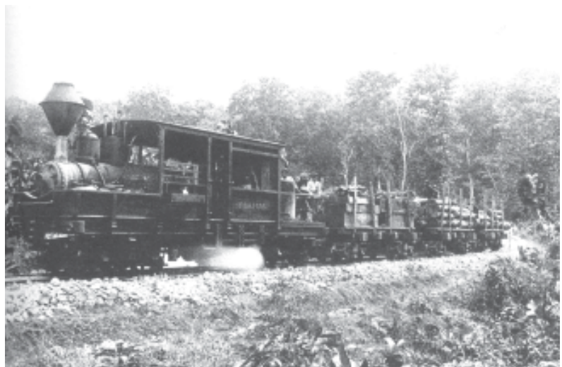
Fig.21 – Train transporting teak out of the forest – late colonial period.

As in India, the need to manage forests for shipbuilding and railways led to the