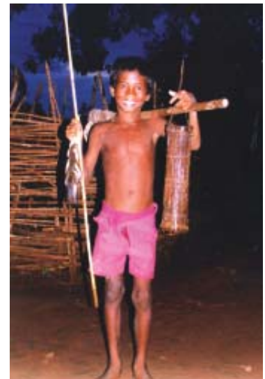
Fig. 17 – The little fisherman.

While the forest laws deprived people of their customary rights to hunt, hunting of big game became a sport. In India, hunting of tigers and other animals had been part of the culture of the court and nobility for centuries. Many Mughal paintings show princes and emperors enjoying a hunt. But under colonial rule the scale of hunting increased to such an extent that various species became almost extinct. The British saw large animals as signs of a wild, primitive and savage society. They believed that by killing dangerous animals the British