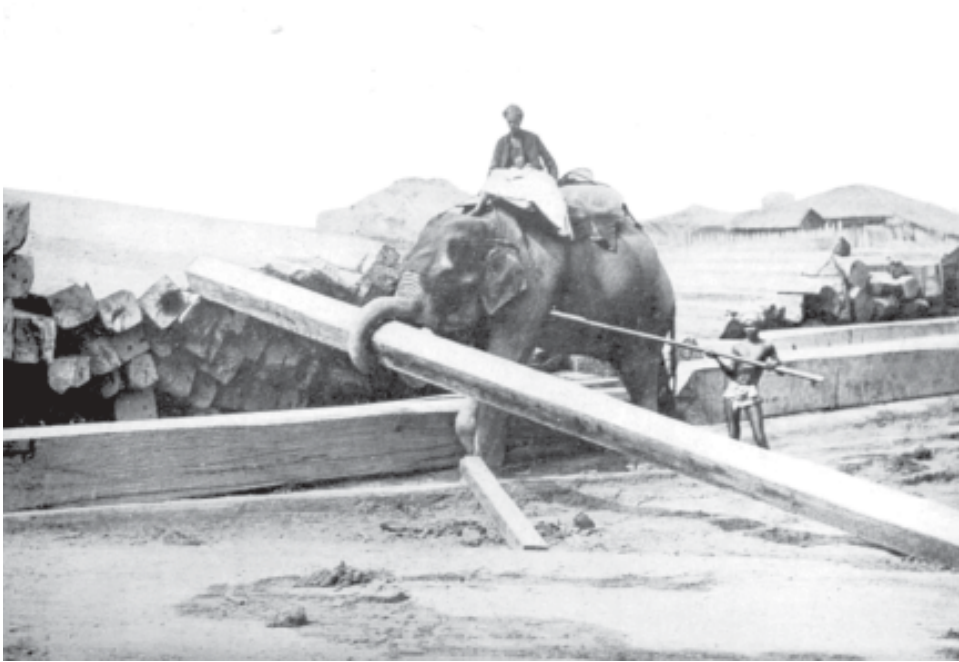
Fig.5 – Elephants piling squares of timber at a timber yard in Rangoon. In the colonial period elephants were frequently used to lift heavy timber both in the forests and at the timber yards.