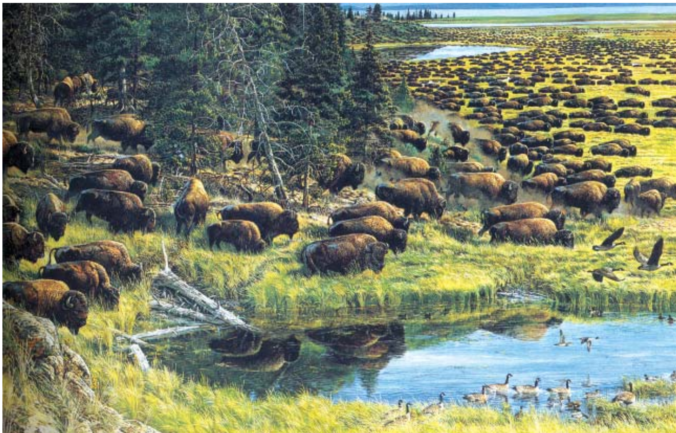
Fig.2 – When the valleys were full. Painting by John Dawson.

In 1600, approximately one-sixth of India's landmass was under cultivation. Now that figure has gone up to about half. As population increased over the centuries and the demand for food went up, peasants extended the boundaries of cultivation, clearing forests and breaking new land. In the colonial period, cultivation expanded rapidly for a variety of reasons. First, the British directly encouraged