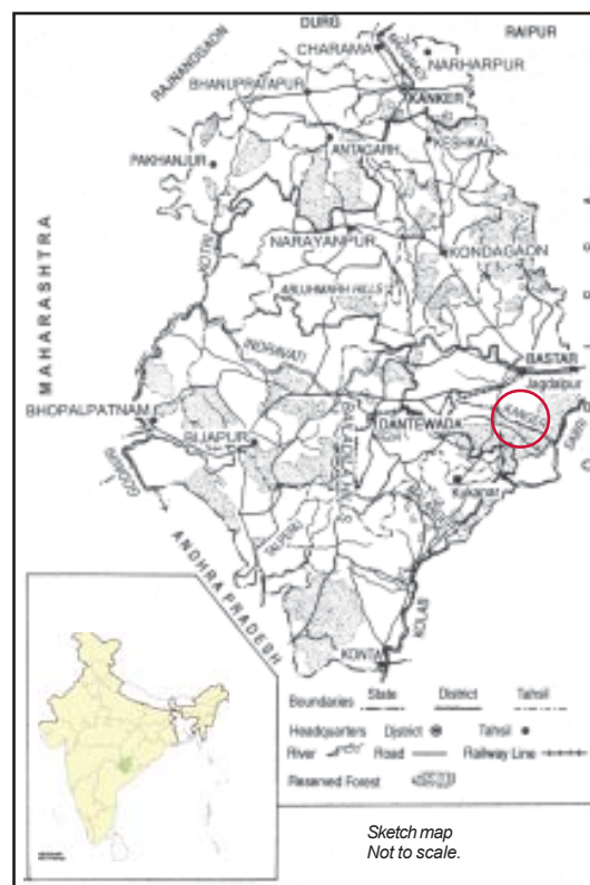
Fig.20 – Bastar in 2000.

Bastar is located in the southernmost part of Chhattisgarh and borders Andhra Pradesh, Orissa and Maharashtra. The central part of Bastar is on a plateau. To the north of this plateau is the Chhattisgarh plain and to its south is the Godavari plain. The river Indrawati winds across Bastar east to west. A number of different communities live in Bastar such as Maria and Muria Gonds, Dhurwas, Bhatras and Halbas. They speak different languages but share common customs and beliefs. The people of Bastar believe that each village was given its land by the Earth, and in return, they look after