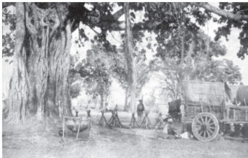
Fig.19 – Army camp in Bastar, 1910.

In 1947 Bastar kingdom was merged with Kanker kingdom and become Bastar district in Madhya Pradesh. In 1998 it was divided again into three districts, Kanker, Bastar and Dantewada. In 2001, these became part of Chhattisgarh. The 1910 rebellion first started in the Kanger forest area (encircled) and soon spread to other parts of the state.