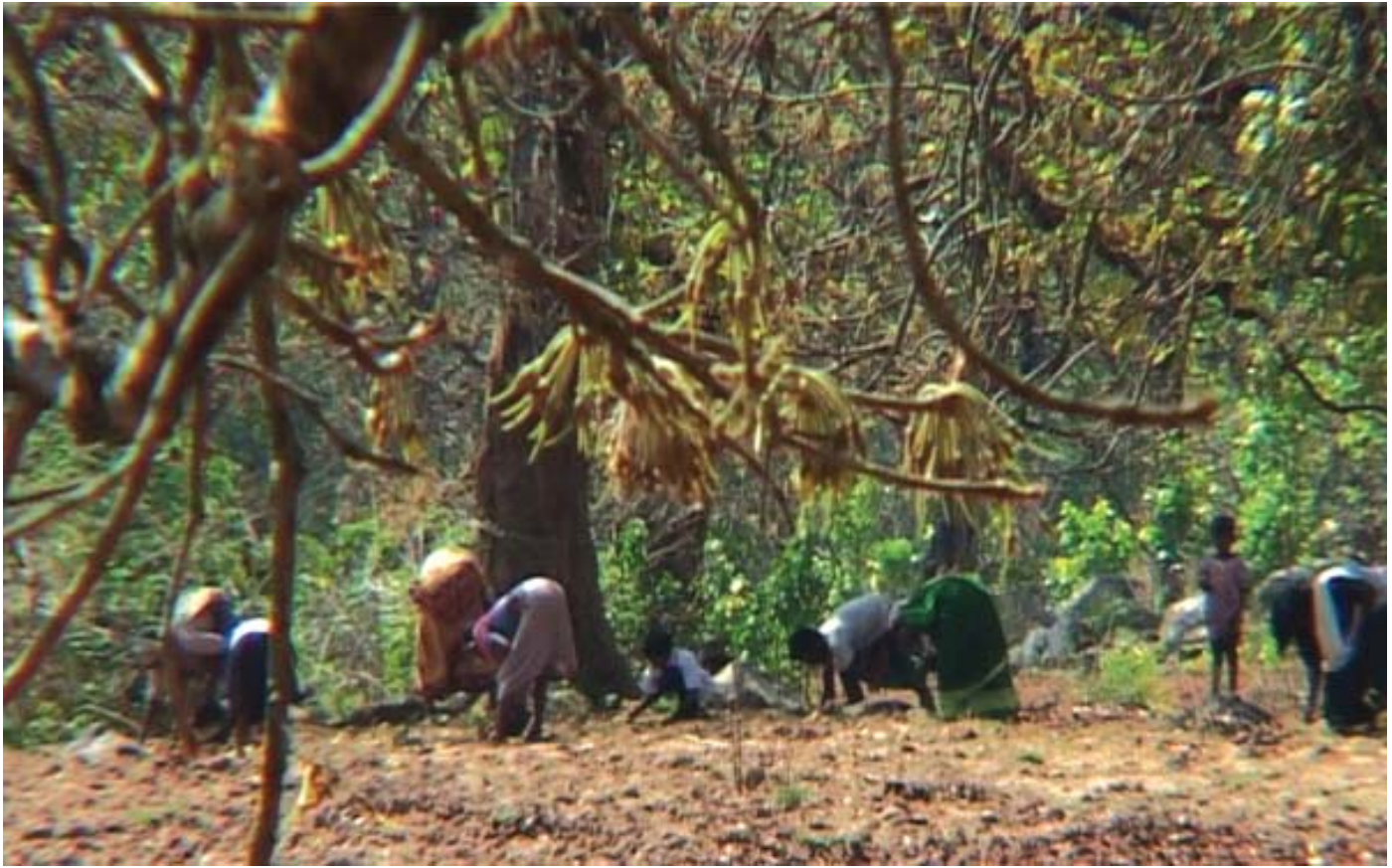
Fig. 12 – Collecting mahua ( Madhuca indica ) from the forests.

Villagers wake up before dawn and go to the forest to collect the mahua flowers which have fallen on the forest floor. Mahua trees are precious. Mahua flowers can be eaten or used to make alcohol. The seeds can be used to make oil.