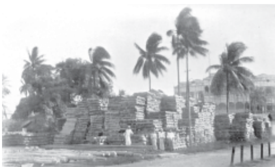
Fig.23 – Indian Munitions Board, War Timber Sleepers piled at Soolay pagoda ready for shipment, 1917.

The Allies would not have been as successful in the First World War and the Second World War if they had not been able to exploit the resources and people of their colonies. Both the world wars had a devastating effect on the forests of India, Indonesia and elsewhere. The forest department cut freely to satisfy war needs.