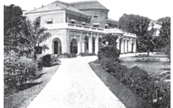
Fig. 11 – The Imperial Forest School, Dehra Dun, India. The first forestry school to be inaugurated in the British Empire.

Foresters and villagers had very different ideas of what a good forest should look like. Villagers wanted forests with a mixture of species to satisfy different needs – fuel, fodder, leaves. The forest department on the other hand wanted trees which were suitable for building