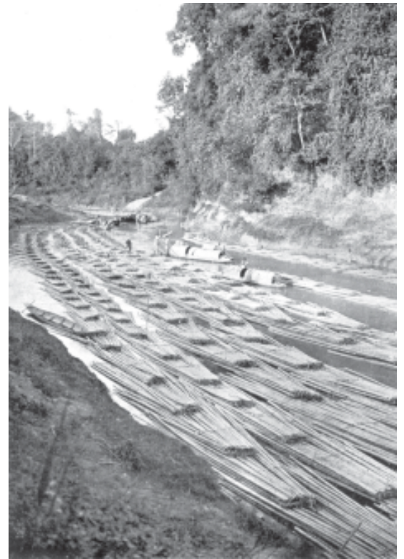
Fig.4 – Bamboo rafts being floated down the Kassalong river, Chittagong Hill Tracts.

From the 1860s, the railway network expanded rapidly. By 1890, about 25,500 km of track had been laid. In 1946, the length of the tracks had increased to over 765,000 km. As the railway tracks spread through India, a larger and larger number of trees were felled. As early as the 1850s, in the Madras Presidency alone, 35,000 trees were being cut annually for sleepers. The government gave out contracts to individuals to supply the required quantities. These contractors began cutting trees indiscriminately. Forests around the railway tracks fast started disappearing.