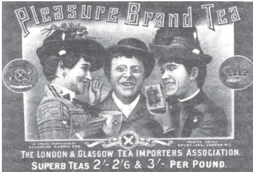
Fig.8 – Pleasure Brand Tea.

Large areas of natural forests were also cleared to make way for tea, coffee and rubber plantations to meet Europe's growing need for these commodities. The colonial government took over the forests, and gave vast areas to European planters at cheap rates. These areas were enclosed and cleared of forests, and planted with tea or coffee.