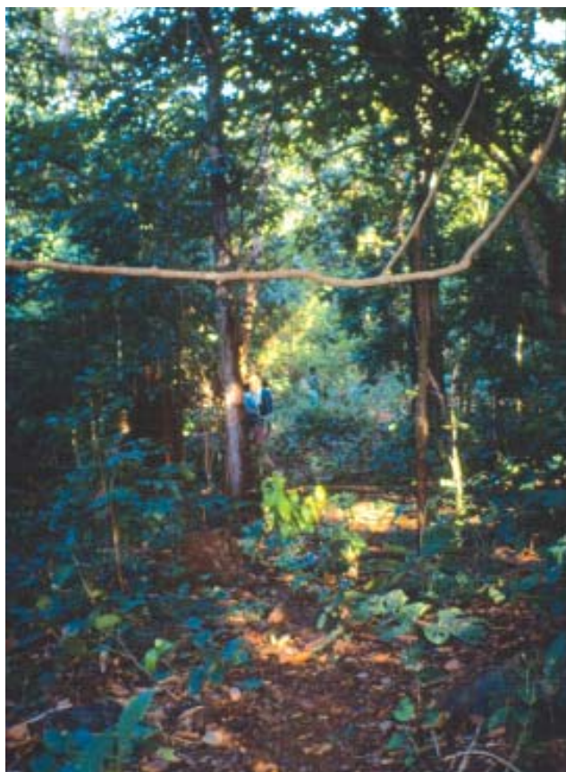
Fig. 1 – A sal forest in Chhattisgarh. Look at the different heights of the trees and plants in this picture, and the variety of species. This is a dense forest, so very little sunlight falls on the forest floor.

A lot of this diversity is fast disappearing. Between 1700 and 1995, the period of industrialisation, 13.9 million sq km of forest or 9.3 per cent of the world's total area was cleared for industrial uses, cultivation, pastures and fuelwood.