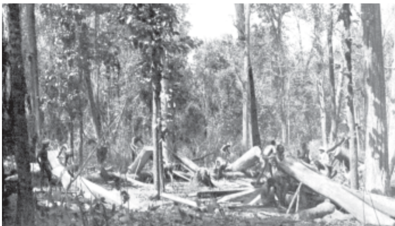
Fig.3 – Converting sal logs into sleepers in the Singhbhum forests, Chhotanagpur, May 1897.

Adivasis were hired by the forest department to cut trees, and make smooth planks which would serve as sleepers for the railways. At the same time, they were not allowed to cut these trees to build their own houses.